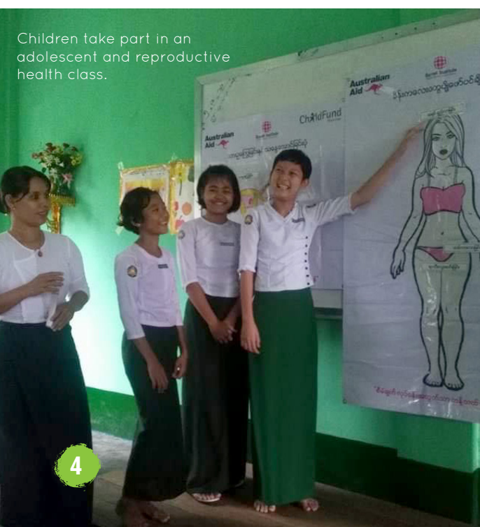
Children take part in an adolescent and reproductive health class.

For the first time, many children are now learning about their bodies and emotions, how to take better care of themselves and prepare for the physical and emotional changes ahead.