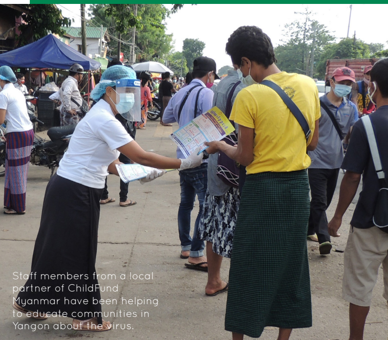
Staff members from a local partner of ChildFund Myanmar have been helping to educate communities in Yangon about the virus.

ChildFund is also helping to strengthen child protection case management systems during the pandemic. This will ensure appropriate systems and processes are in place to support vulnerable children and young people.