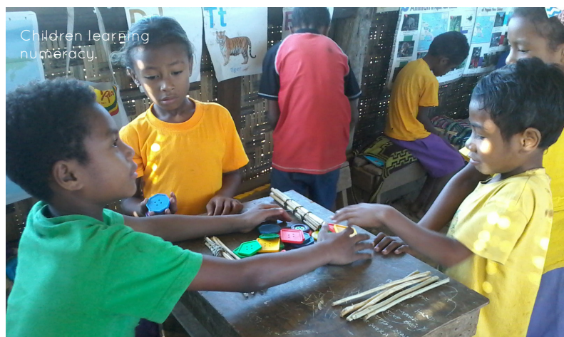
Children learning numeracy.

As part of its COVID-19 response activities, ChildFund is also helping to keep children healthy by distributing hygiene kits and handwashing stations in schools.